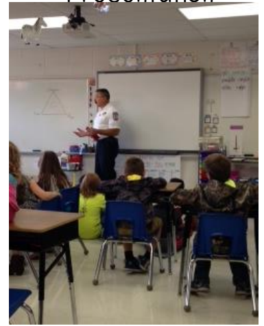
Teacher for the Day