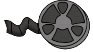
3 rd Grade Fire Safety Presentation