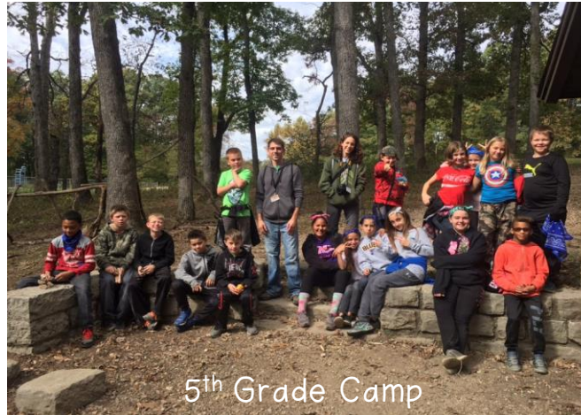
5 th Grade Camp