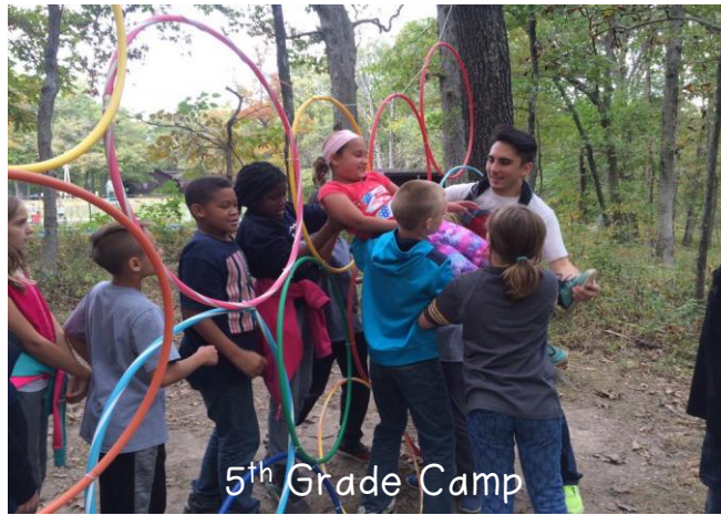
5 th Grade Camp