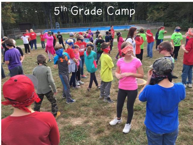
5 th Grade Camp